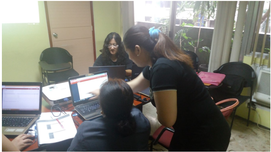
Facilitators from NEO Cypher Learning and Experts Academy while teaching the AIDE staffs