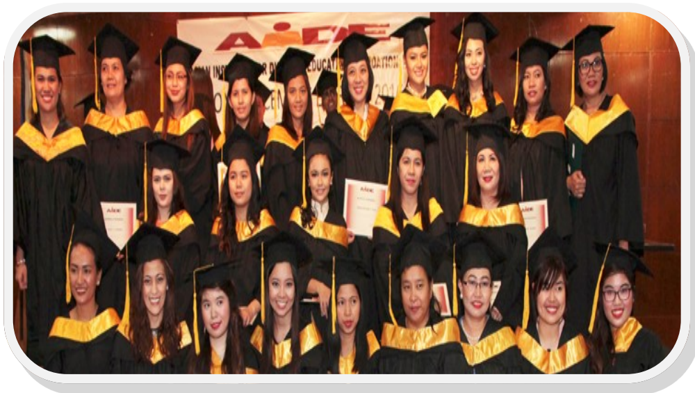
AIDE graduates in one of the Institute's Commencement Exercises